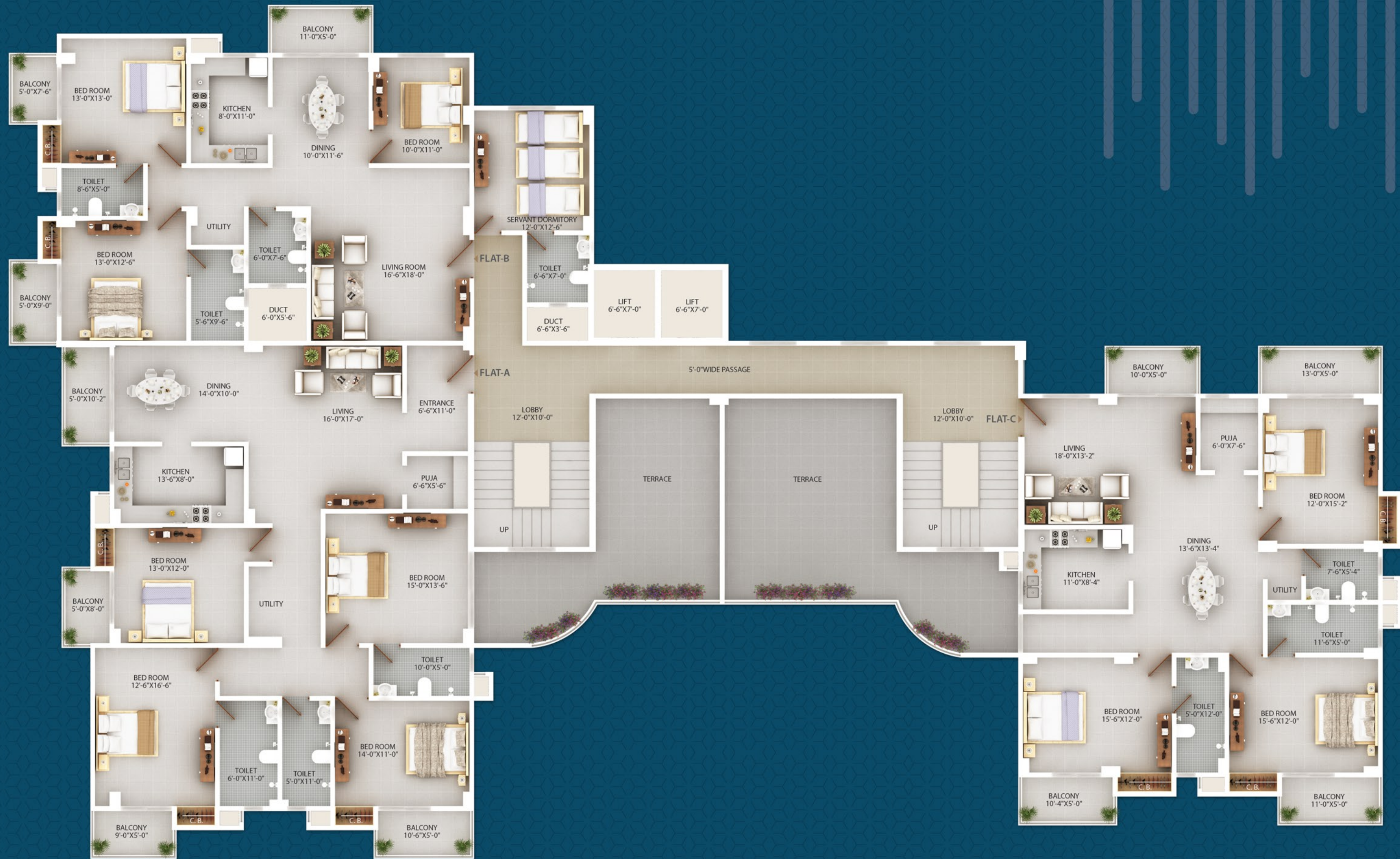
Typical 5th & 7th Floor