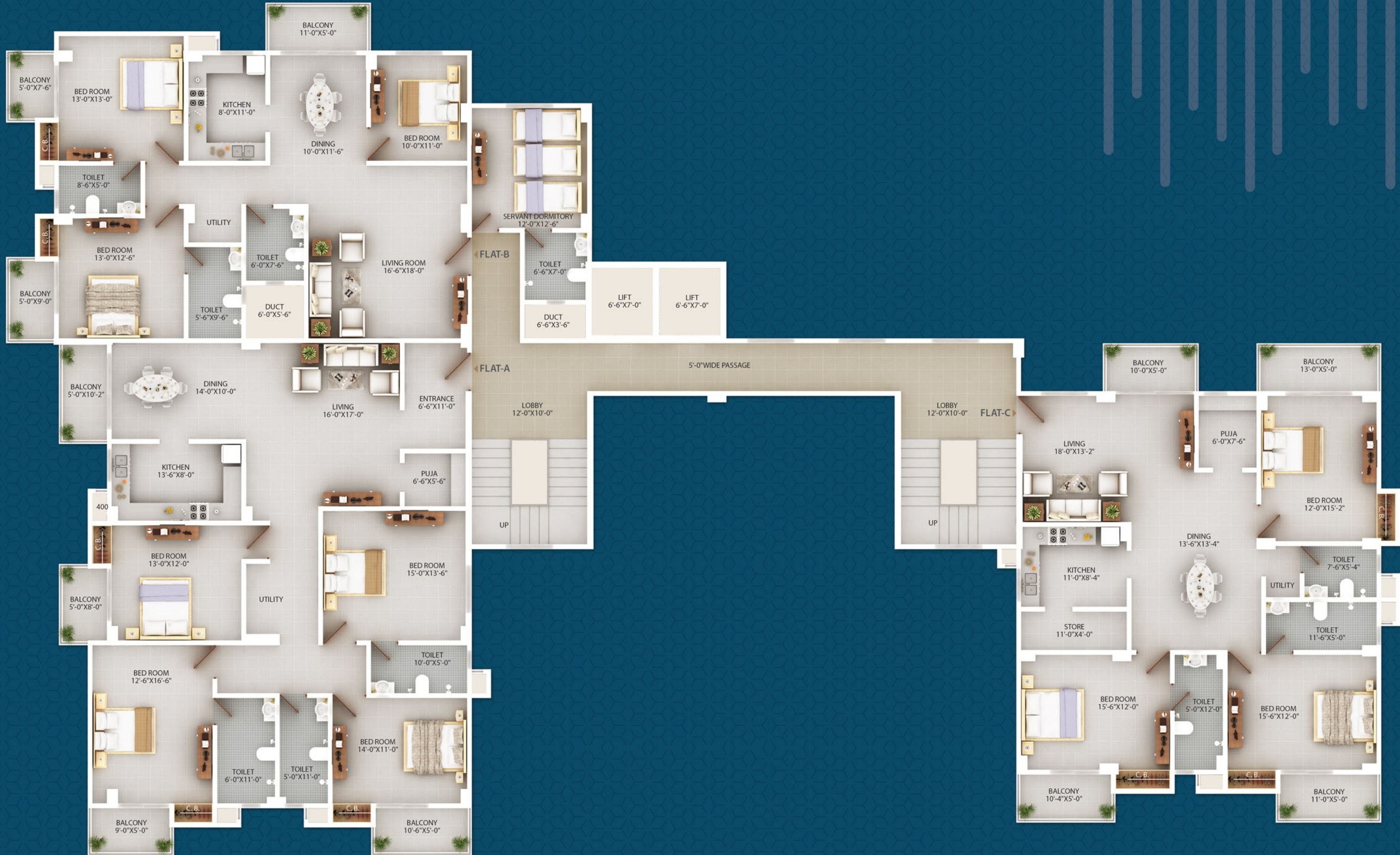
Typical 4th, 6th & 8th Floor